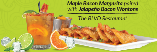
Maple Bacon Margarita paired with Jalapeño Bacon Wontons